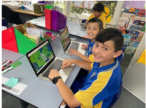
Students coding in 3/4A