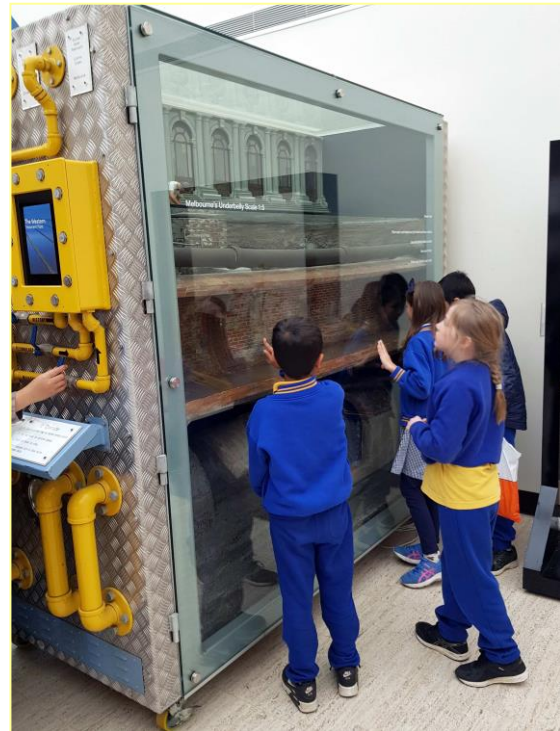
This image shows one of the 10 settling ponds Students are interested in a display tank.