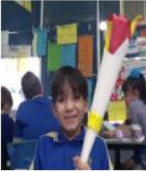
Will W 3D