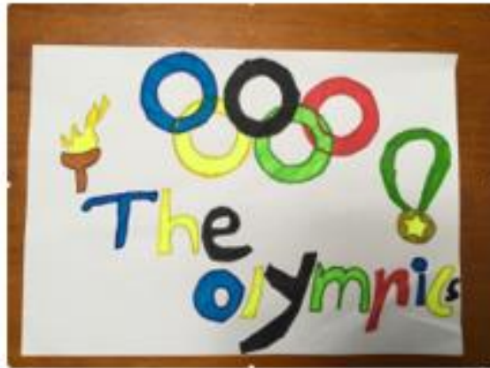
Lam H, 34E

During Flexible and Remote Learning, the 3/4 students have been learning about The Olympic Games as part of our Inquiry Unit: The Olympic Games and Australian Symbols.