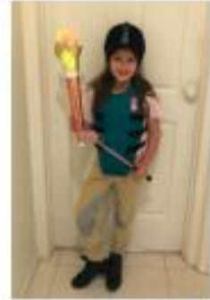
Mila B 34B