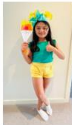
Salina M 34E