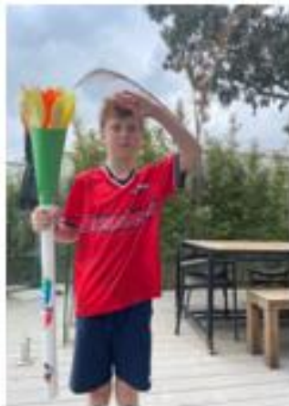
Cooper B 34A