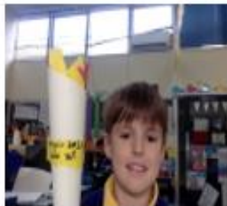
Luca S 34F