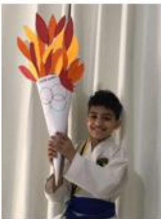
Maittam R 34A

Here are examples of creative Olympic torches that were designed by students in grade 34 during Flexible and Remote Learning