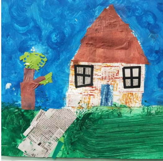
"Home is somewhere that protects you." Haris