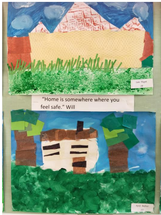
"Home is somewhere where you feel safe." Will